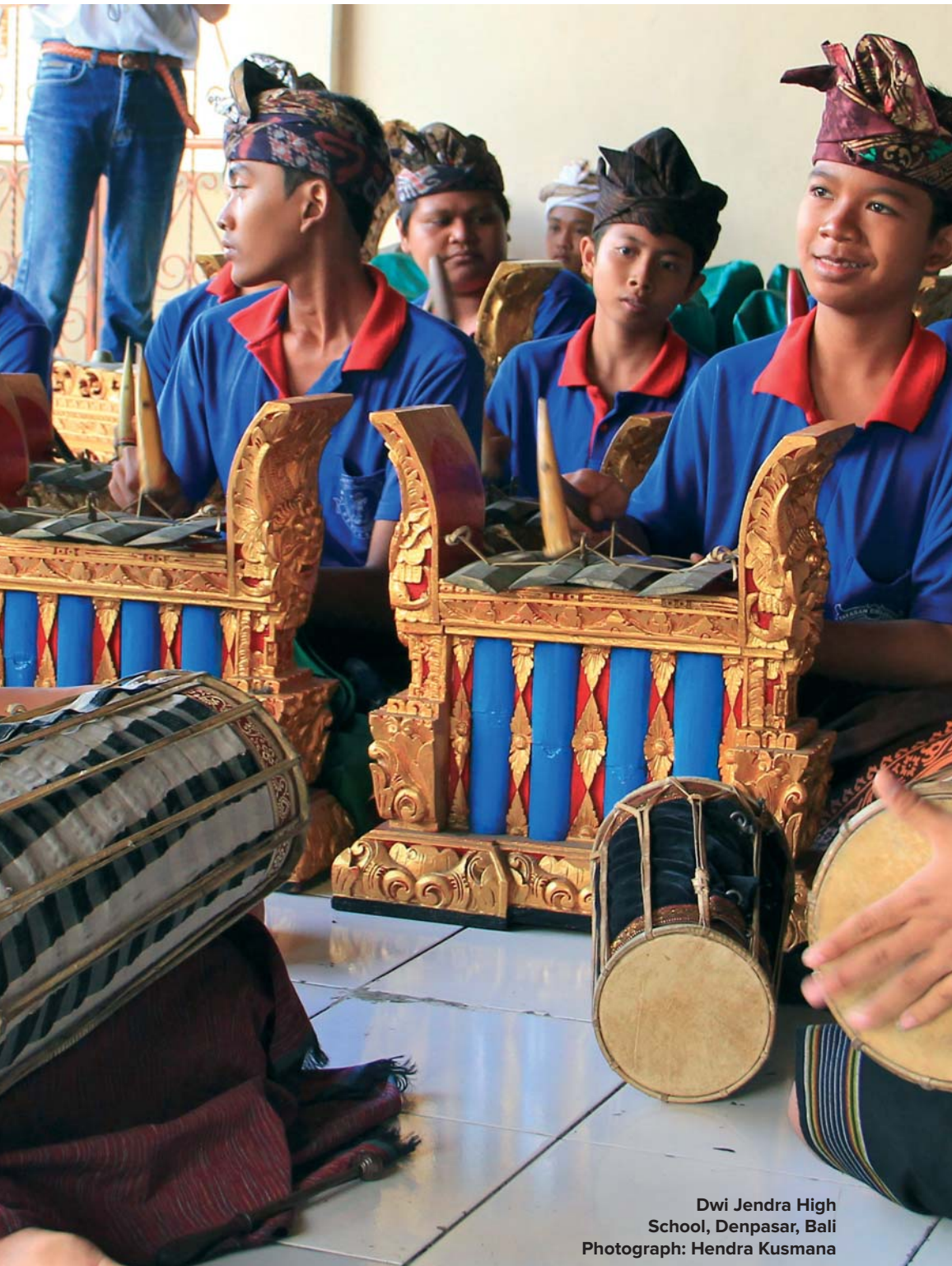
Dwi Jendra High School, Denpasar, Bali