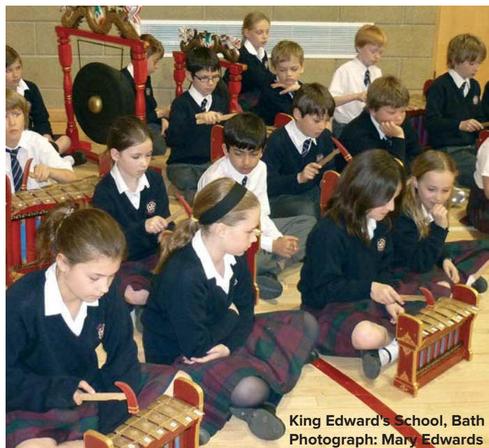
King Edward's School, Bath